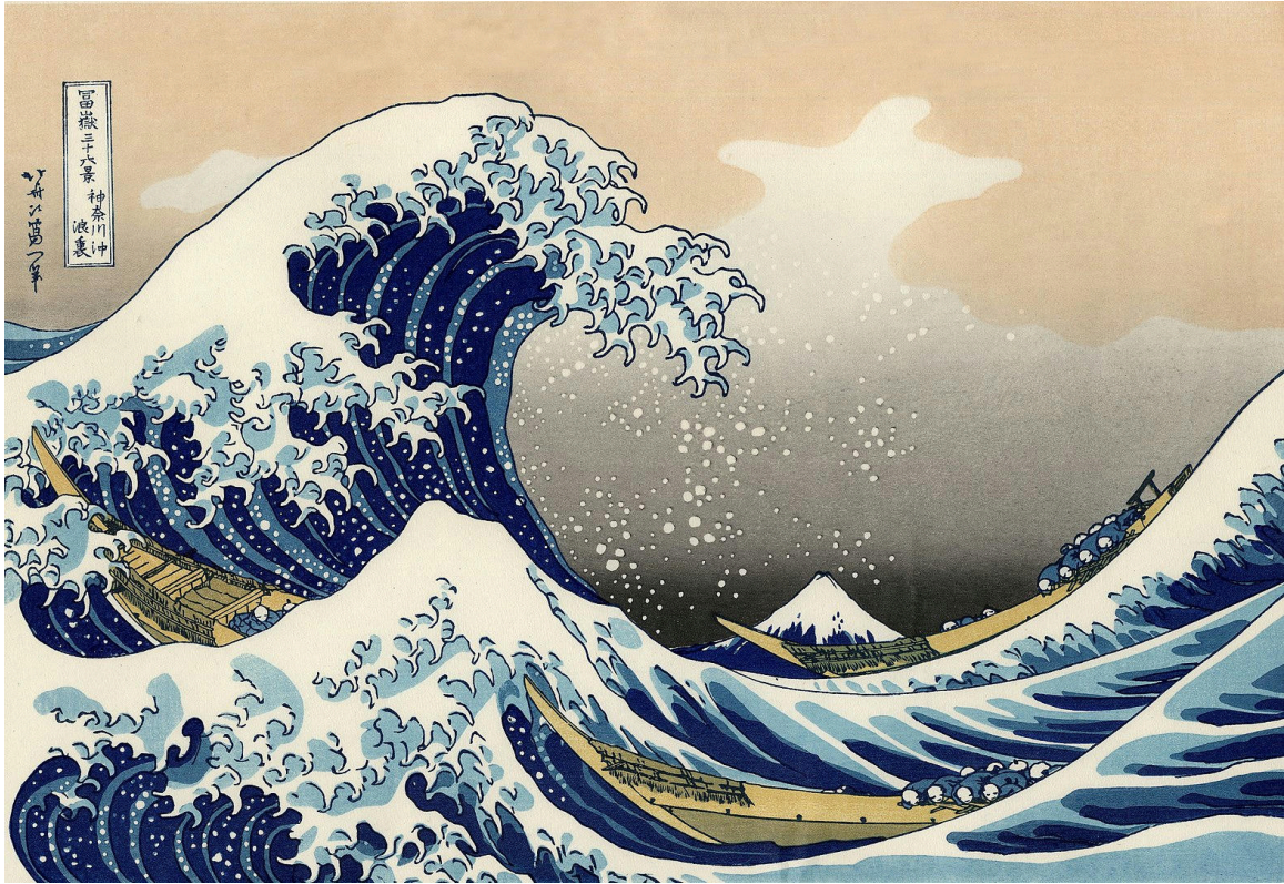
Figure A.1: The Great Wave off Kanagawa . A woodblock print by Katsushika (1831).

The section numbering will be changed to “A.1.1” in the appendix. The second section in the appendix will be “B”. On the other hand, the figure numbering will be reset to “A.1”, “A.2” so that it is clear that these figures are part of the appendix. The “A” stands for the “Appendix”, not the section numbering.